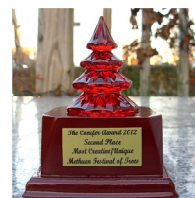
Last year's award, 2nd most creative

Ornaments must be submitted by the October meeting (10/17).