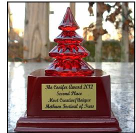
Last year's award—Second Place most Creative/Unique