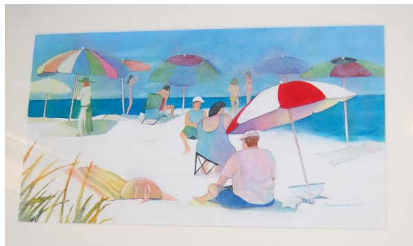
“A Day at the Beach”